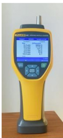
Figure 1: The particle counter, measuring the number of particles per liter of air of a given size indicated in the display. When aerosols are produced, these are visible as an increase in the different channels over the background (dust) particles. The average size of aerosols produced by human activity is around 5 \mu\text{m} , after evaporation of the water contained in saliva this gives rise to aerosols of about 1-2 \mu\text{m} . We thus use this size range also for the production of the artificial aerosols; the measurements presented below show the data for the 1 \mu\text{m} channel, however other channels give similar results and especially the same persistence time to within the experimental accuracy.

Aerosol concentration is often measured using a laser sheet diffraction technique [11]. Using this technique as the standard, we validated a novel method using a handheld particle counter (Fluke 985, Fluke B.V. Europe, Eindhoven, The Netherlands) which is frequently used for air quality assessment, overcomes most of the above-mentioned drawbacks of the laser sheet diffraction technique [11-13] (Figure1).